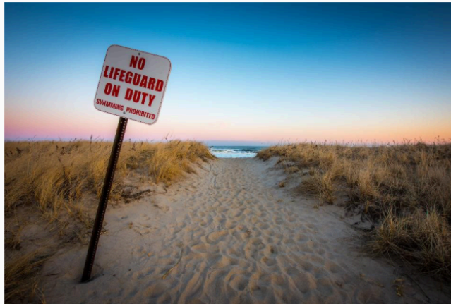
Beach path on Long Island in "The Hamptons" with sign for No Lifeguard on Duty. Sunset colors and scene.

In the Hamptons, the cherry tree blossoms are about to burst, and the swallows are back. Traffic has picked up; the first asparagus emerge from the soil and chefs are busy testing new recipes. Along Route 27, the air pulses with the sound of construction and renovation—the 2019 Season is around the corner. Here are a few notable openings: