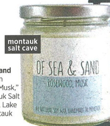
montauk salt cave