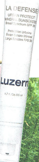
Luzern La Defense mineral sunscreen SPF 30, $60 at the Baker House 1650, 181 Main St., East Hampton