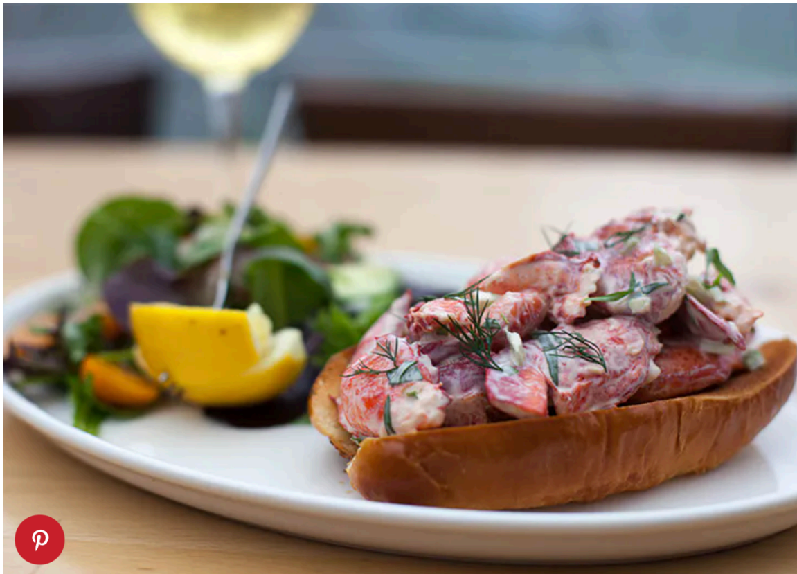
MANNA AT LOBSTER INN